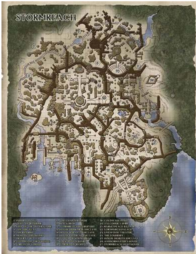
MAP 4: Stormreach (see Secrets of Xen'Drik , p.17)